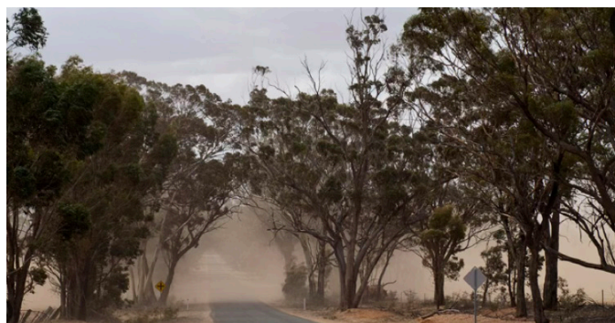
Photograph of a Recent Wind Erosion Occurrence in NSW